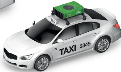
Public transport vehicles: taxi