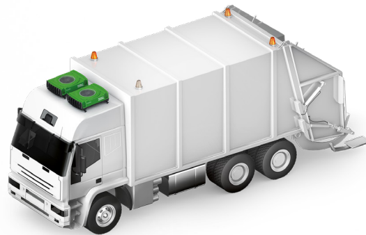
Waste disposal vehicles