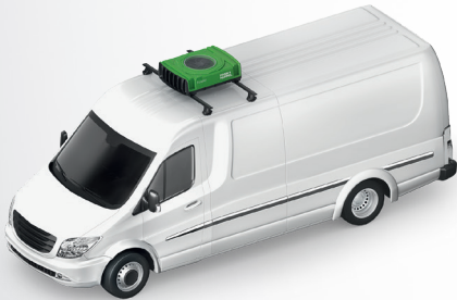
Delivery service vehicles